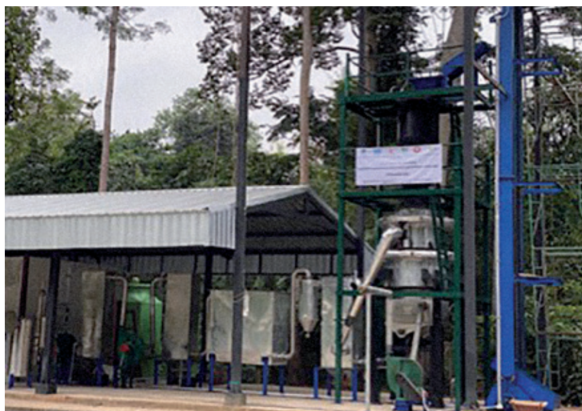
The Wang Nam Khiao training and research station was initiated in 2017