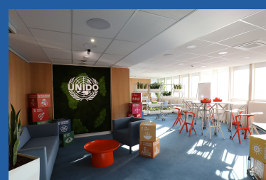
State-of-the-art space for UNIDO teams