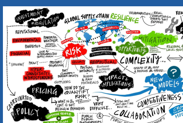
Supply chain governance is changing. What's at stake for developing countries?