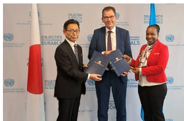
Promotion of Japanese investment and technology to continue