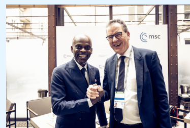
Munich Security Conference: we need closer cooperation and partnerships between industrialized and developing countries