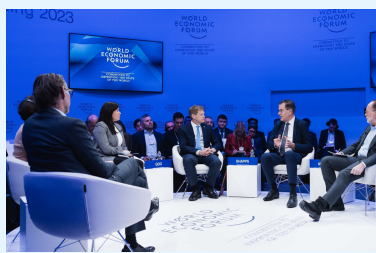
At the World Economic Forum, UNIDO emphasizes the need for partnerships to share knowledge and technology with developing countries