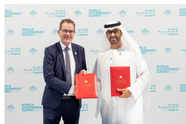
UNIDO and UAE Minister of Industry, Dr. Sultan Al Jaber reinforce industrial partnerships on decarbonization, green hydrogen and food security