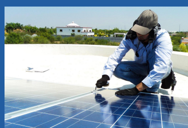
Project highlight: Climate action in Tunisia