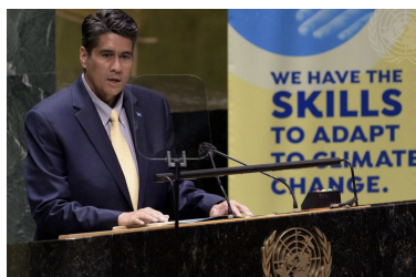
Republic of Palau becomes 171st UNIDO member state