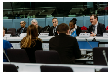
Fifth UNIDO-European Union High-Level Dialogue with Jutta Urpilainen, Commissioner for International Partnerships agrees on new joint projects