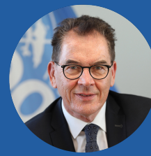
Gerd Müller UNIDO Director General

"Last year was difficult for everyone. Nevertheless, we managed to close 2022 with a balanced budget while mobilizing 17% more funds for technical cooperation projects. And with our reform measures we have made UNIDO fit for the future! I thank all our UNIDO colleagues, as well as our Member States, for making this great achievement possible. Teamwork is key!" Read the full statement...