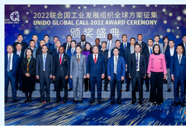
UNIDO Global Call 2022 winners announced