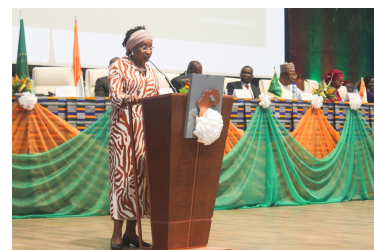
The 17th African Union Industrialization Summit: UNIDO stresses need for sustainable investments in energy, digitalization, and skills development to accelerate Africa's growth