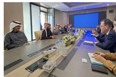
UNIDO and Saudi Arabia enhance cooperation to promote investments and local industry and talks about responsible mining at the Ministerial Round Table