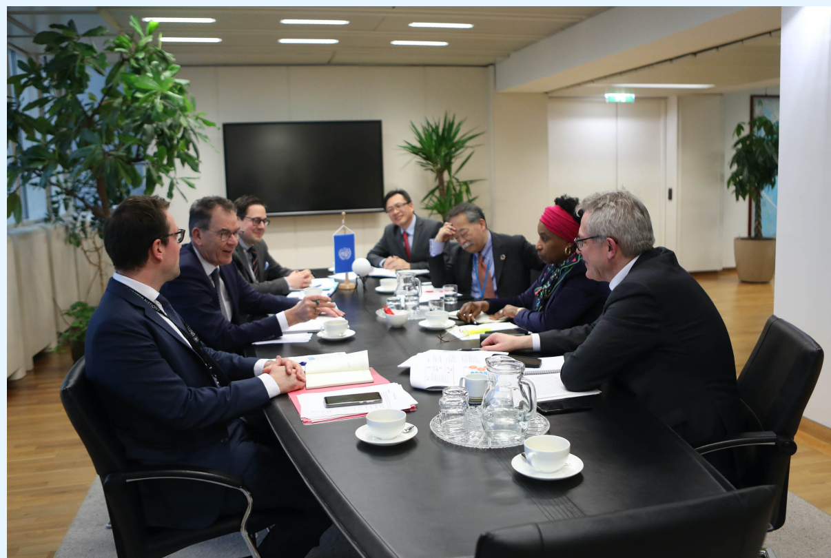
The UNIDO reform process "Progress by innovation" in action Read the full article...